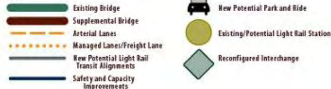
Pictured: Alternative #4