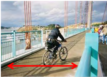
Carquinez Bridge Vallejo, CA 12' shared-use path (1) Total 12'