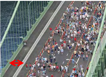
Tacoma Narrows Bridge Tacoma, WA 10' shared-use path (1) Total 10'