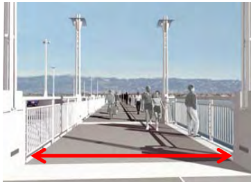
New Bay Bridge SF/Oakland, CA 15.5' shared-used path (1) 7.5' belvederes (2) Total 15.5'