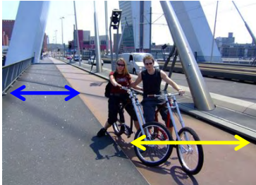
Erasmusbrug Rotterdam, Netherlands 6' sidewalks (2) 6' bike lanes (2) Total: 24'