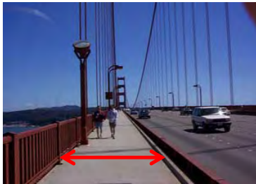
Golden Gate Bridge San Francisco, CA 10' shared-use path (1 full-time) 10' (5' clear) bike path (weekend) 1' raised above roadway Total 10' (15' weekend)