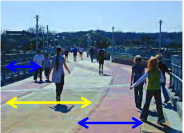
Pfluger Bridge Austin, TX 10' bi-directional bike path (1) 5' sidewalks (2) 15' observation deck Total: 20'