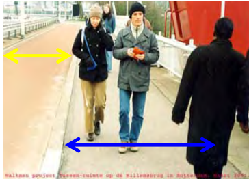
Willemsbrug Rotterdam, Netherlands 6' sidewalks (2) 6' bike lanes (2) Total: 24'