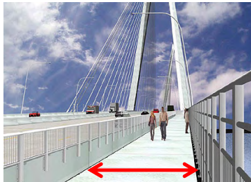
Cooper River Bridge Charleston, SC 12' shared-use path (1) Total 12'