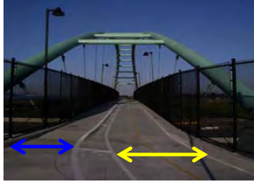
I-80 Ped/Bike Bridge Berkeley, CA 8' bi-directional bike path (1) 5' sidewalk (1) Total: 13'