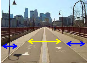
Stone Arch Bridge Minneapolis, MN Bi-directional bike path (1) Sidewalks (2) Total: 24'