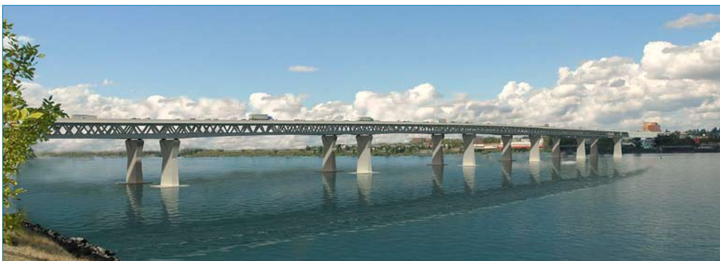
Concept rendering of deck truss bridge for replacement I-5 bridge.