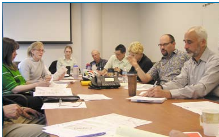
The Pedestrian and Bicycle Advisory Committee (PBAC).

The Pedestrian and Bicycle Advisory Committee (PBAC) was established to guide the development of improvements for people who walk or bike in or through the project area. PBAC consists of pedestrian and bicycle advocates, community members and agency representatives. PBAC has held more than 30 meetings since spring 2007, conducted field visits and provided extensive reviews of project design elements, resulting in the following work to date: