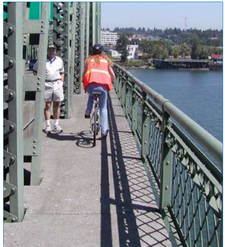
Today's Interstate Bridge paths are too narrow for pedestrians and bicyclists to safely pass each other.