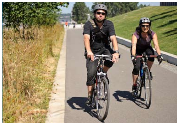
Multi-use paths, bike lanes and sidewalks will be added and improved within the Columbia River Crossing project area.

The CRC project is planning two structures to replace the existing I-5 bridge. These structures will take advantage of space underneath the roadway deck by adding a lower deck between the supporting steel trusses. The northbound structure will carry vehicle traffic above and have a covered path for pedestrians and bicyclists on the lower deck. The southbound structure will carry vehicle traffic above with light rail underneath.