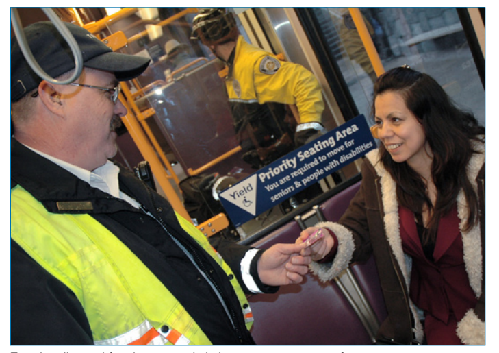
Transit police and fare inspectors help increase passenger safety.