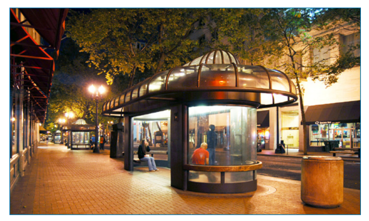
Station lighting increases visibility for those on or approaching platforms.