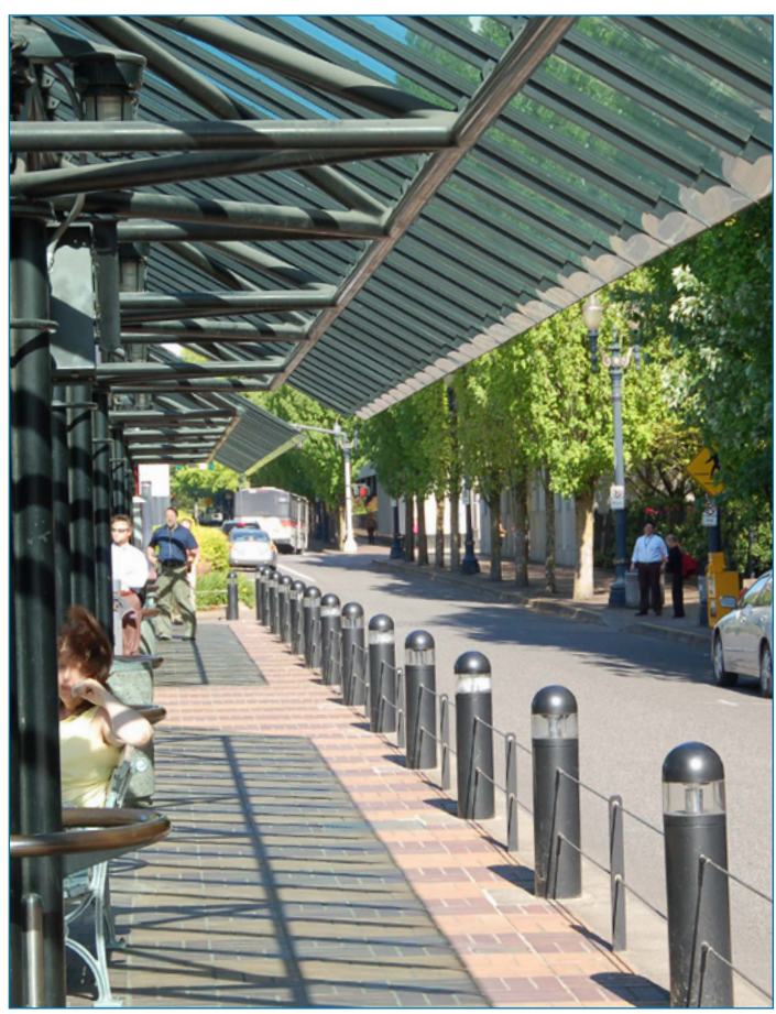
Cable, bollards and distinctive surfaces help define transit, auto and pedestrian areas.

The community will continue to be consulted as light rail designs are refined to gain input on appearance of the stations and streets, park and ride designs and security plans. The monthly meetings of the Portland Working Group and Vancouver Transit Advisory Committee are announced on the CRC website and open to the public.