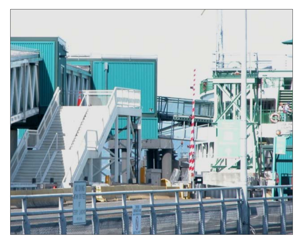
Edmonds OHL Emergency Egress Stairs Exhibit 620-7

Provide emergency egress stairs for the fixed OHL walkway in the vicinity of the shoreward end of the pedestrian transfer span. Consult with the local fire marshal for locating and sizing the stairs. Ensure that an adequate place of refuge or egress exists at the bottom of the stairs.