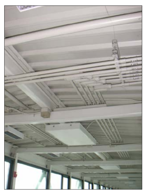
Above the Walkway Structure -Edmonds Ferry Terminal

Consider locating the utilities above the clear height envelope within the OHL fixed spans and transfer span.