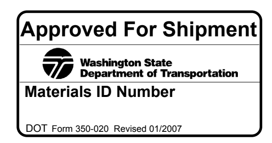
Figure 9-6 Tag

All documentation associated with the tag in Figure 9-6 will be reviewed and approved by the WSDOT Materials Fabrication Inspection Office and kept at the WSDOT Materials Fabrication Inspection Office and kept at the point of manufacture.