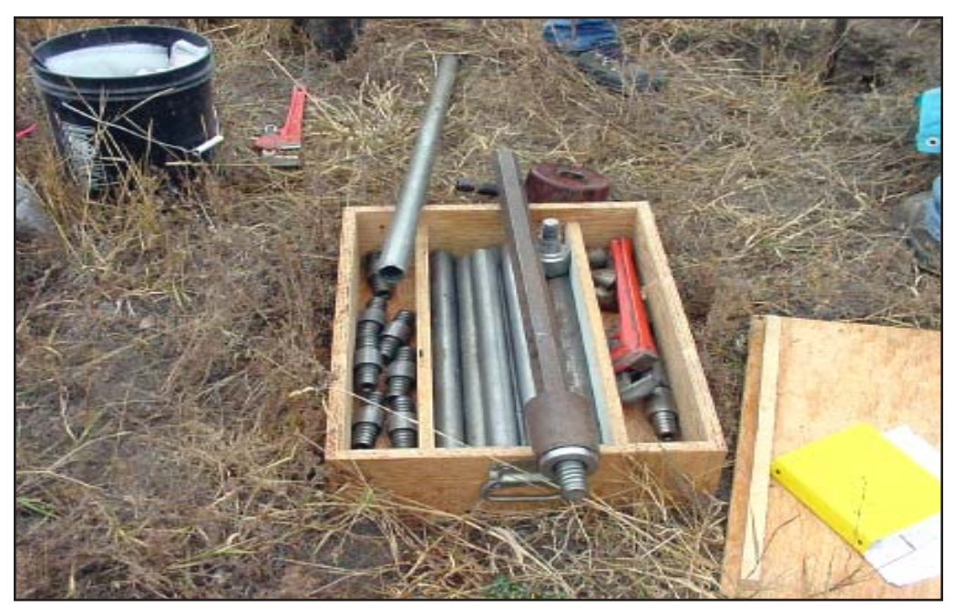
Photo of PP device in the process of being assembled. The threaded coupling devices on the left side of the box are used to connect the cone-shaped tip to lengths forming the body of the penetrometer. The lengths forming the body of the penetrometer are then connected to the section on which the weight slides.