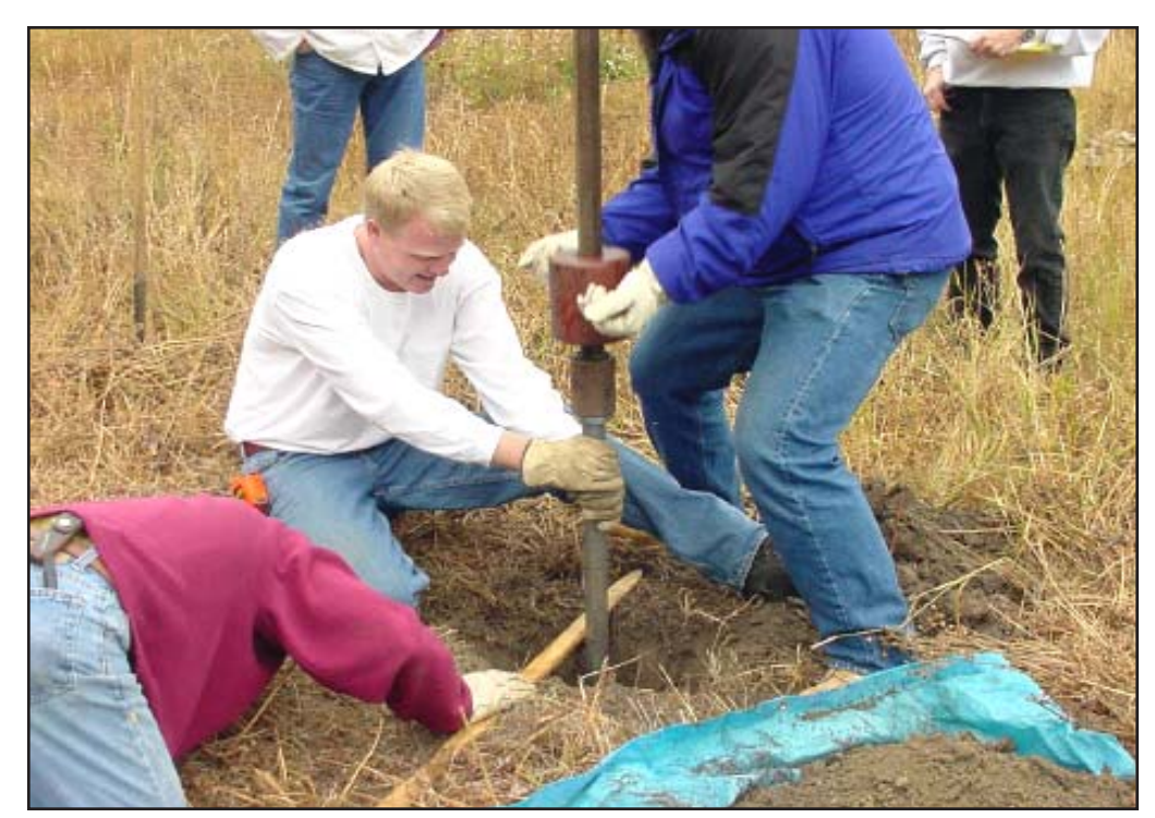
PP testing in progress. Lathe is used to mark the surface of the test hole excavation. In this instance, one person is steadying the equipment, another is lifting and dropping the 35 lb weight, and a third is observing downward displacement and counting blows.