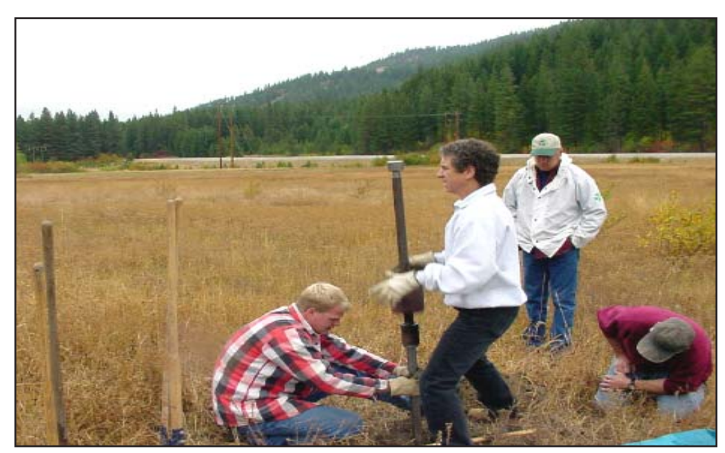
This PP testing can be tiring. Photo shows another person providing relief for the falling weight task.