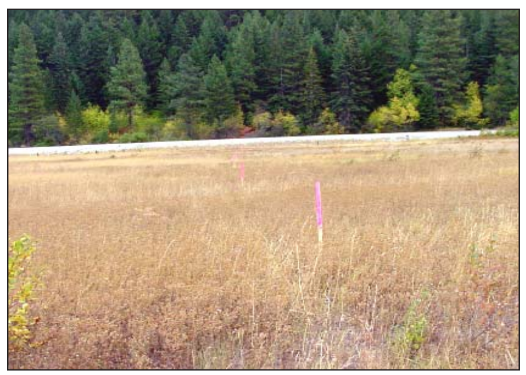
Figures 3-C-1 through 3-C-8 illustrate the equipment and procedures used for conducting the Portable Penetrometer test.

Perform a field reconnaissance of the site of the geotechnical investigation. Insure that the proposed design is tied to an established coordinate system, datum, or permanent monument.