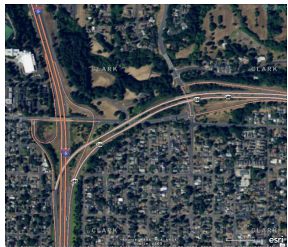
The SR 500 interchange with I-5