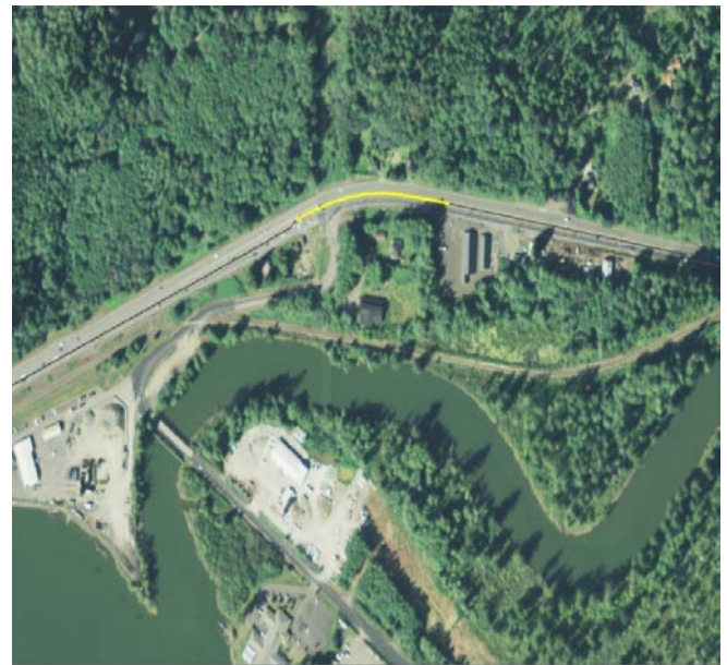
US 12 just east of Aberdeen