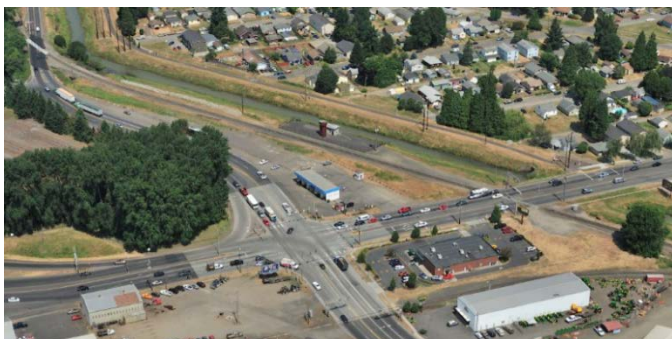
SR 432/SR 433 intersection