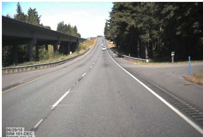
Exhibit 720-1 Phased Development of Multilane Divided Highways

When there is a median gap between bridges of 6 inches or more, the Region PEO will evaluate whether or not the median gap needs to be screened. Address the potential for pedestrians on the bridge and if closing the median gap to less than 6 inches, or installing fencing, netting, or other elements to enclose the area between the bridges would be beneficial. Document this evaluation in the Basis of Design and Alternatives Comparison Table.