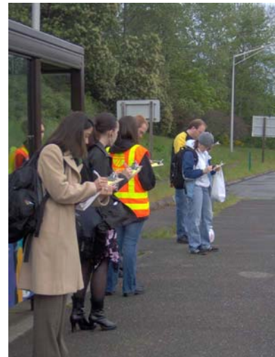
Transit users fill out survey at the Evergreen Point Freeway Station

The data from the completed surveys help to clarify the current use of freeway stations along the SR 520 corridor. It explores a number of important issues: Where are travelers going? Where did they come from? Why do travelers use these freeway stations? How did they arrive at the freeway station? How will they continue their trip at the end? WSDOT used the survey data to study transit opportunities throughout the corridor.