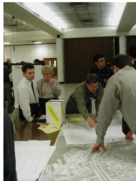
Members of the public review maps and drawings of the project area