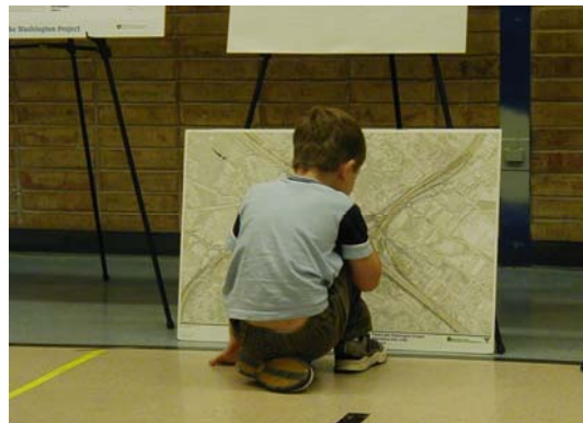
Open house held on June 17, 2004

The project team held open houses many times throughout the project to provide an informal setting for the community to obtain information about the SR 520 Bridge Replacement and HOV Project, make comments, and talk with project staff. Exhibit 4 lists the open house dates and locations.