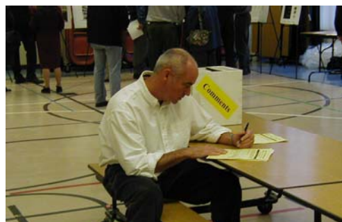
A member of the public completes a comment form at an open house

Public input to the SR 520 Bridge Replacement and HOV Project is an essential element during the alternatives development, environmental analysis,