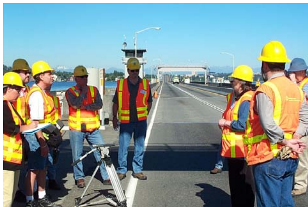
Executive Committee bridge tour

See Attachment 1 for a list of the members of the Executive, Technical, and Advisory Committees.