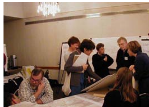
Community design workshop

The project team invited community representatives to attend the workshops. These community representatives were recommended by local jurisdictions and existing community groups, as well as individual community members. Representatives were notified via written invitations in the mail and were also called before the meetings. Agendas for the meetings were distributed in