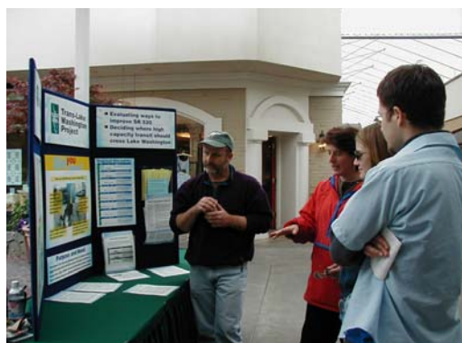
Project information display at University Village in Seattle

To reach as large an audience as possible, the team set up displays, both staffed and unstaffed, to reach people where they normally do business, obtain