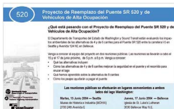
Exhibit 2. June 2004 Open House Notification Translated into Spanish