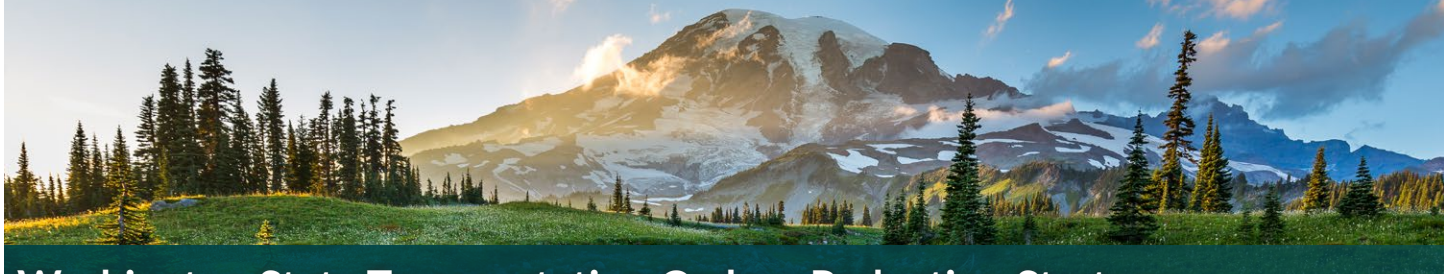
Washington State Transportation Carbon Reduction Strategy